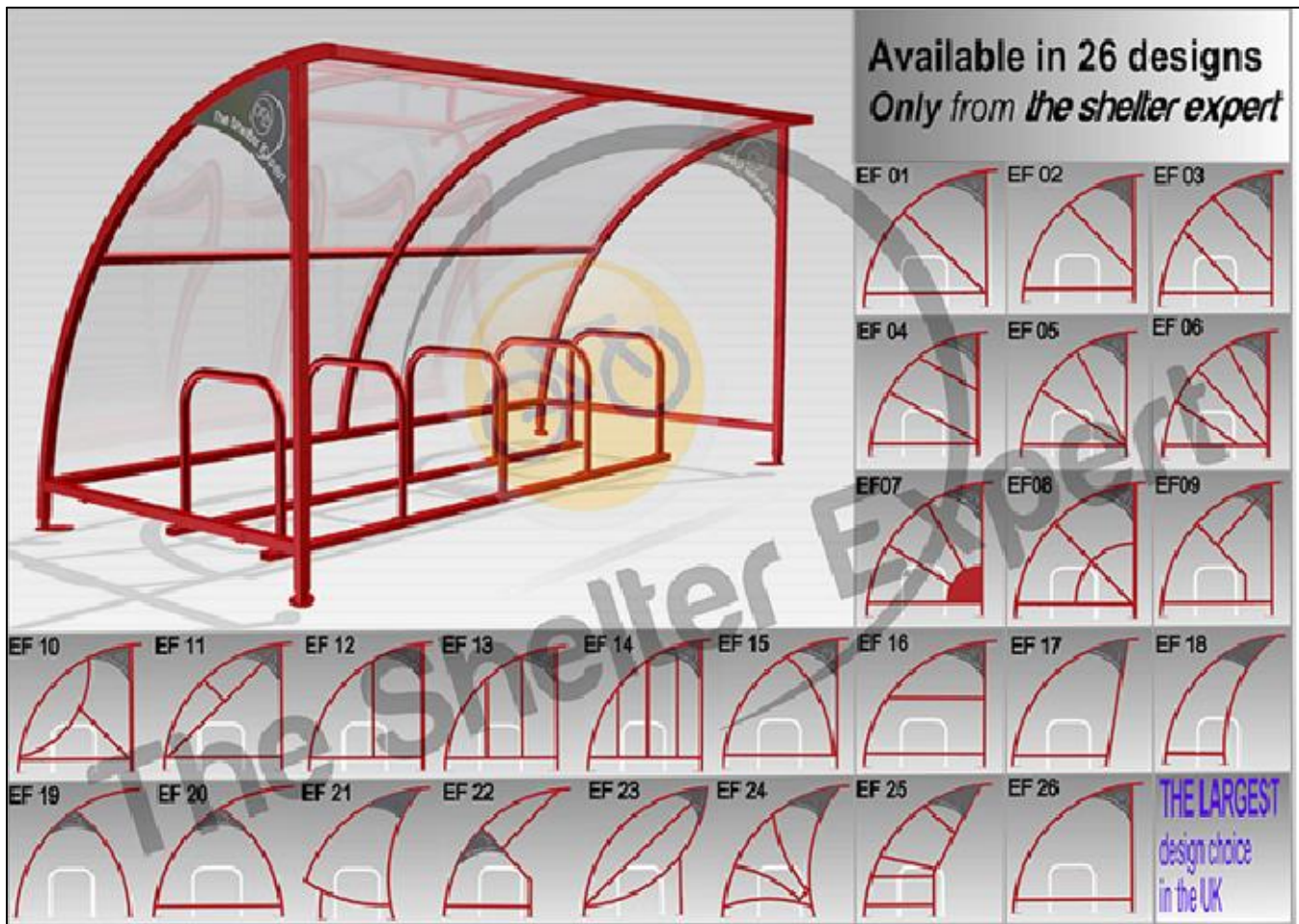
Image of proposed cycle shelter and stands for indicative purposes only Frame to be used is EF22. Frame to be polyester powder coated steel in anthracite grey (RAL 7016) with polycarbonate roof