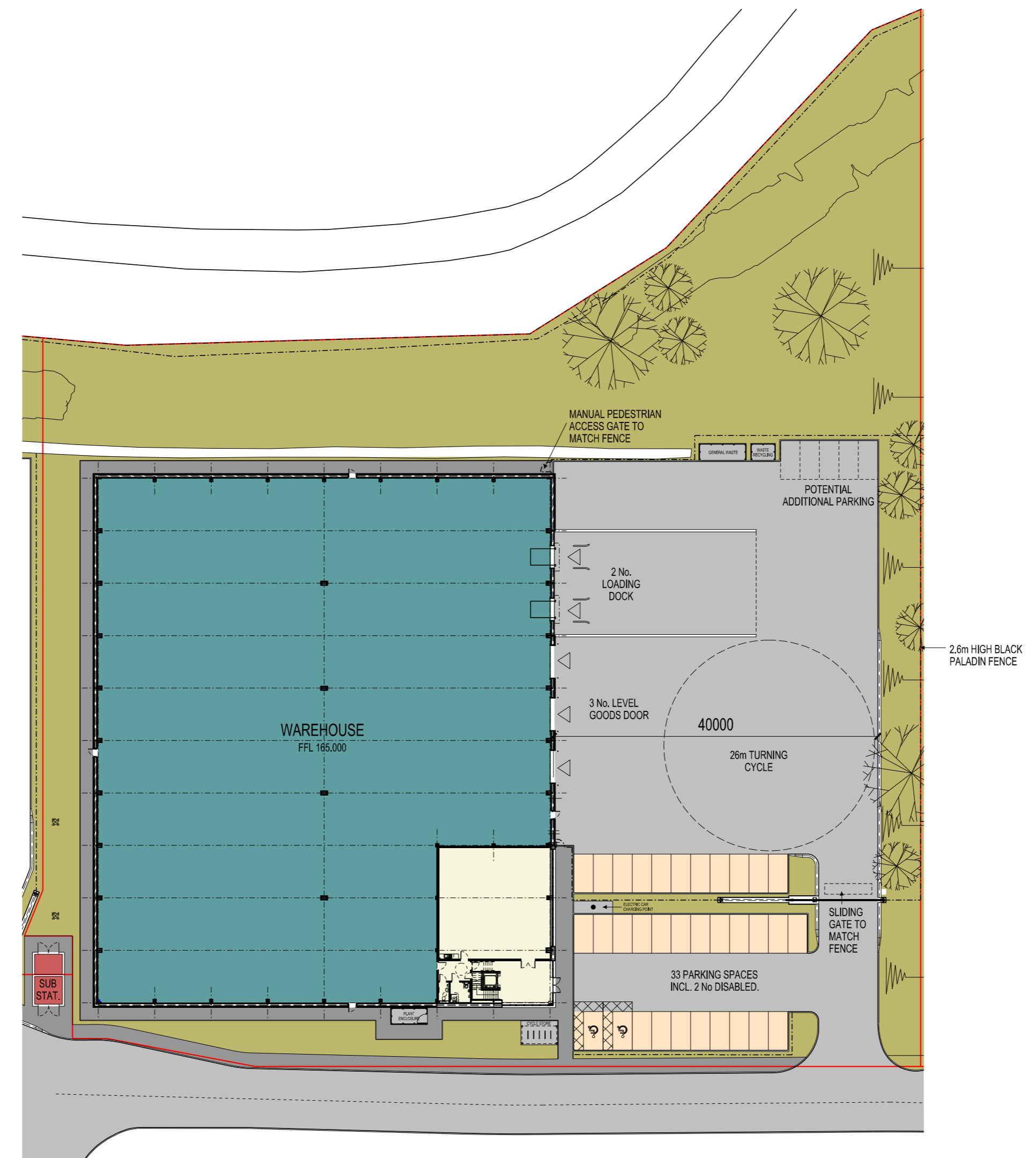
PROPOSED SITE PLAN SCALE 1:500@A2