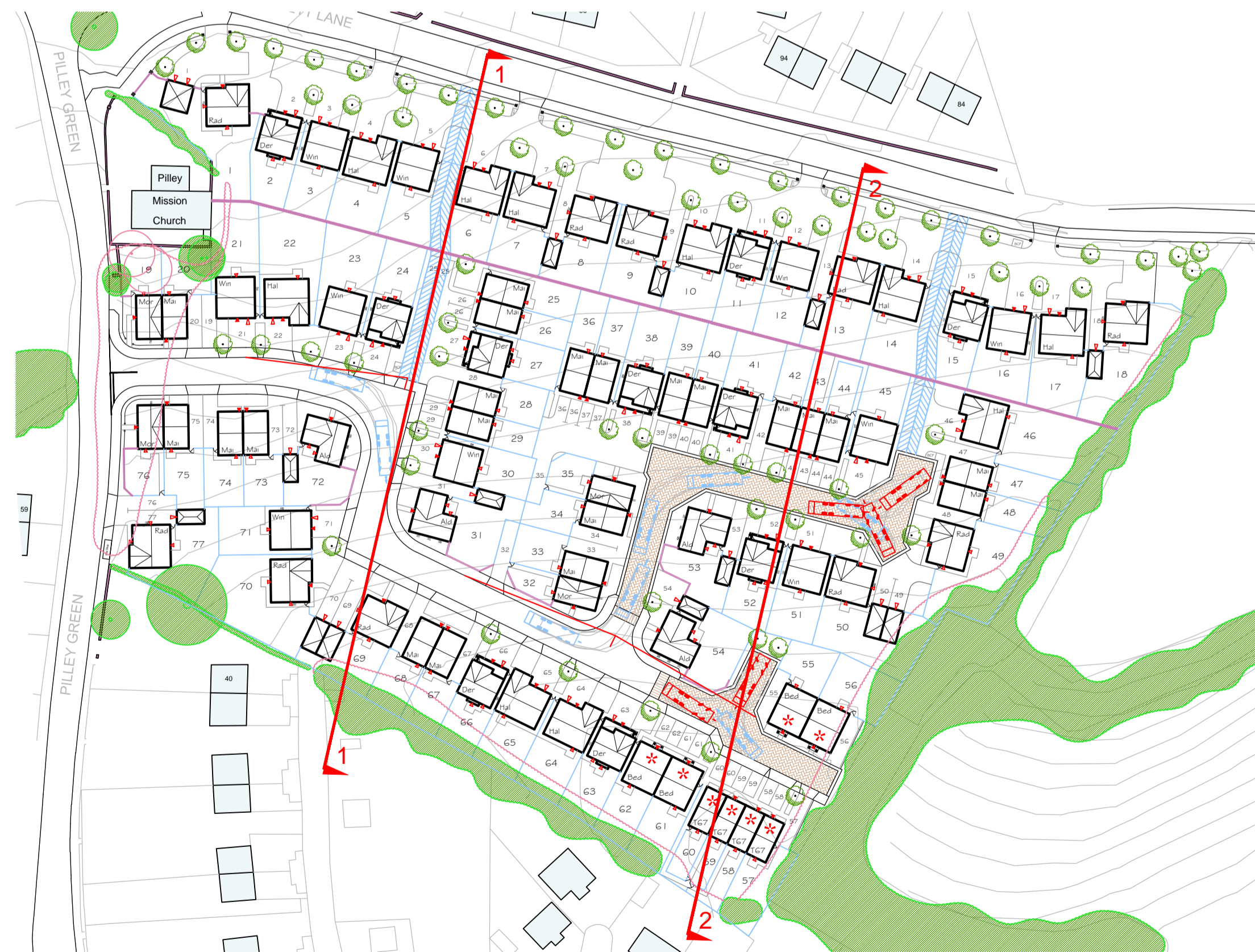
LAYOUT NOT TO SCALE