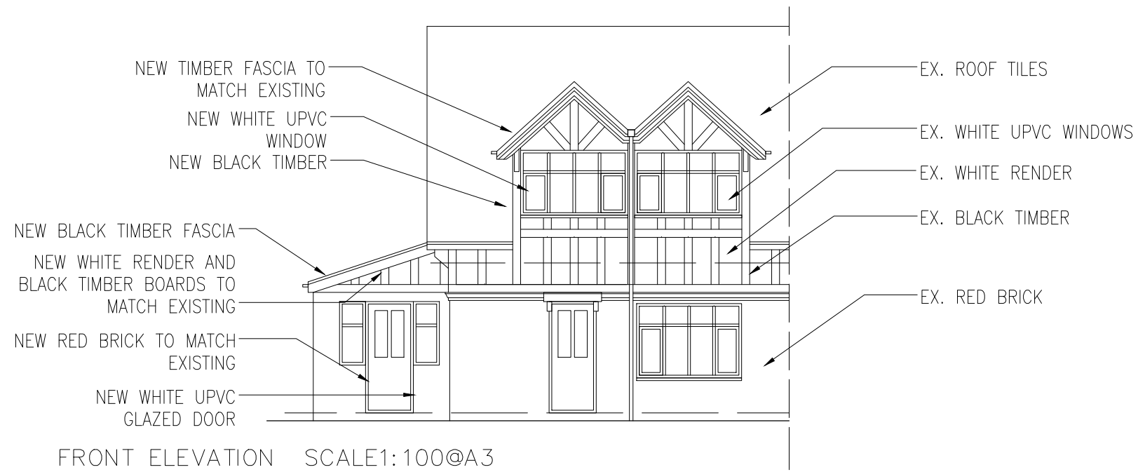
FRONT ELEVATION SCALE1:100@A3