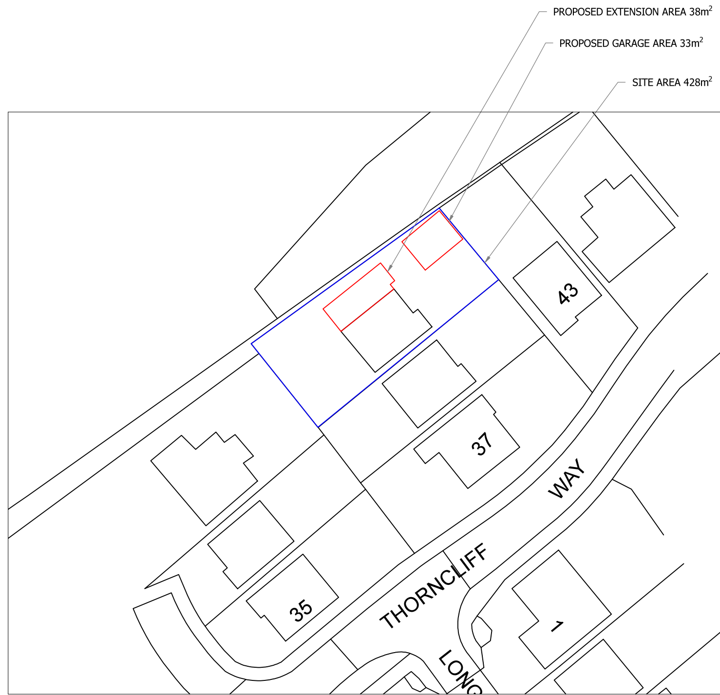
SITE PLAN SCALE 1:500 AT A3