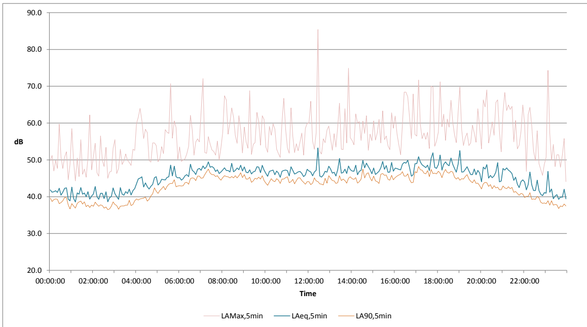
Data Summary Table - Position 2